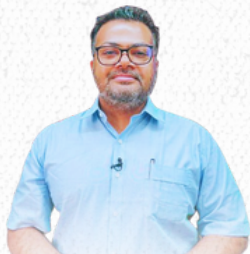
AKSHAY VRAT Experience – 12+ Yrs Subject – Environment

They understand UPSC trends, PYQs and Real exam pressure