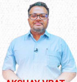
AKSHAY VRAT Experience – 12+ Yrs Subject – Environment

They understand UPSC trends. PYQs. Real exam pressure