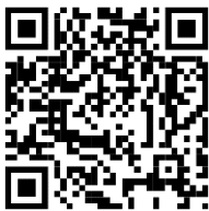
IAS 2-Year GS PCM